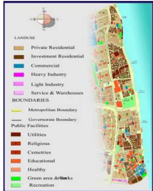
Land use plan for all study area