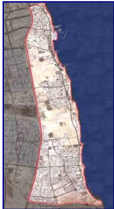
Aerial view of the study area