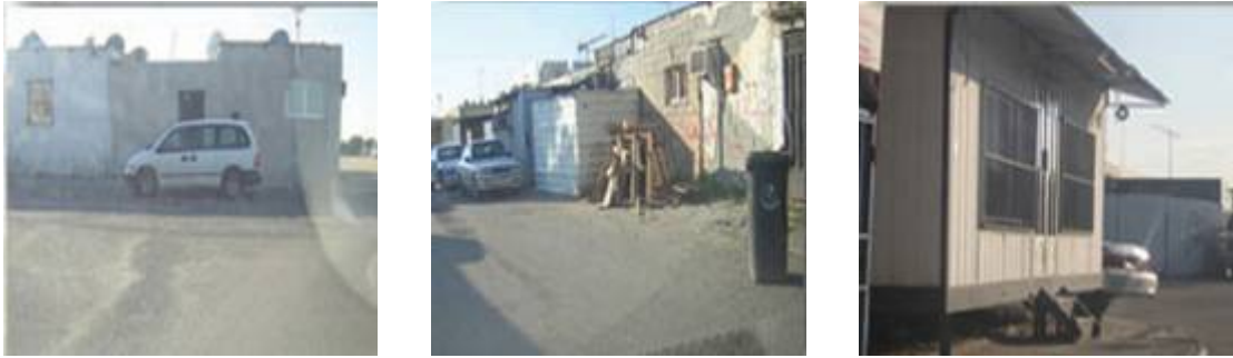
Some houses in the study area