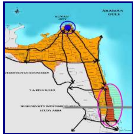
The relationship between Study area and Kuwait city