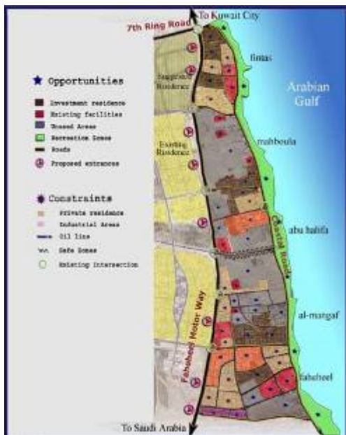
Study area constrains